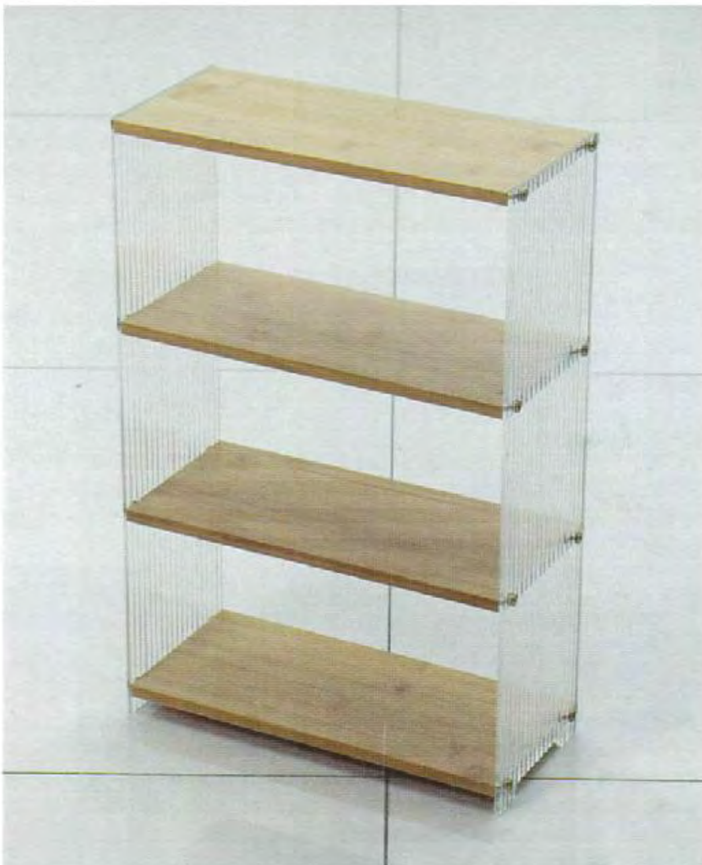
3. Put up the stand