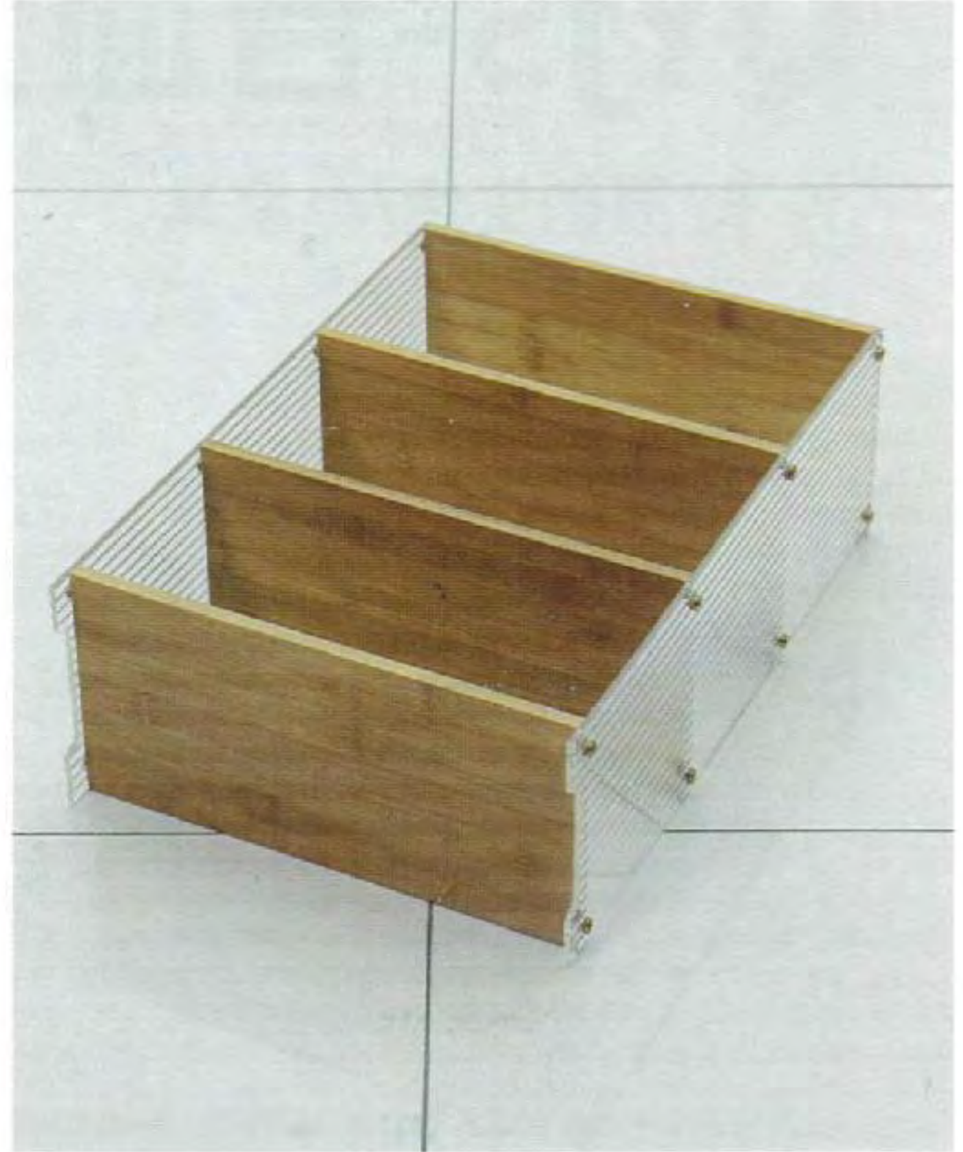
2. Install another bracket in the same way