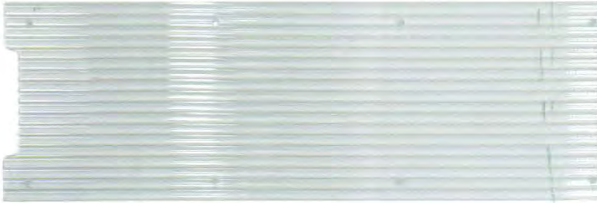
Side stand x2