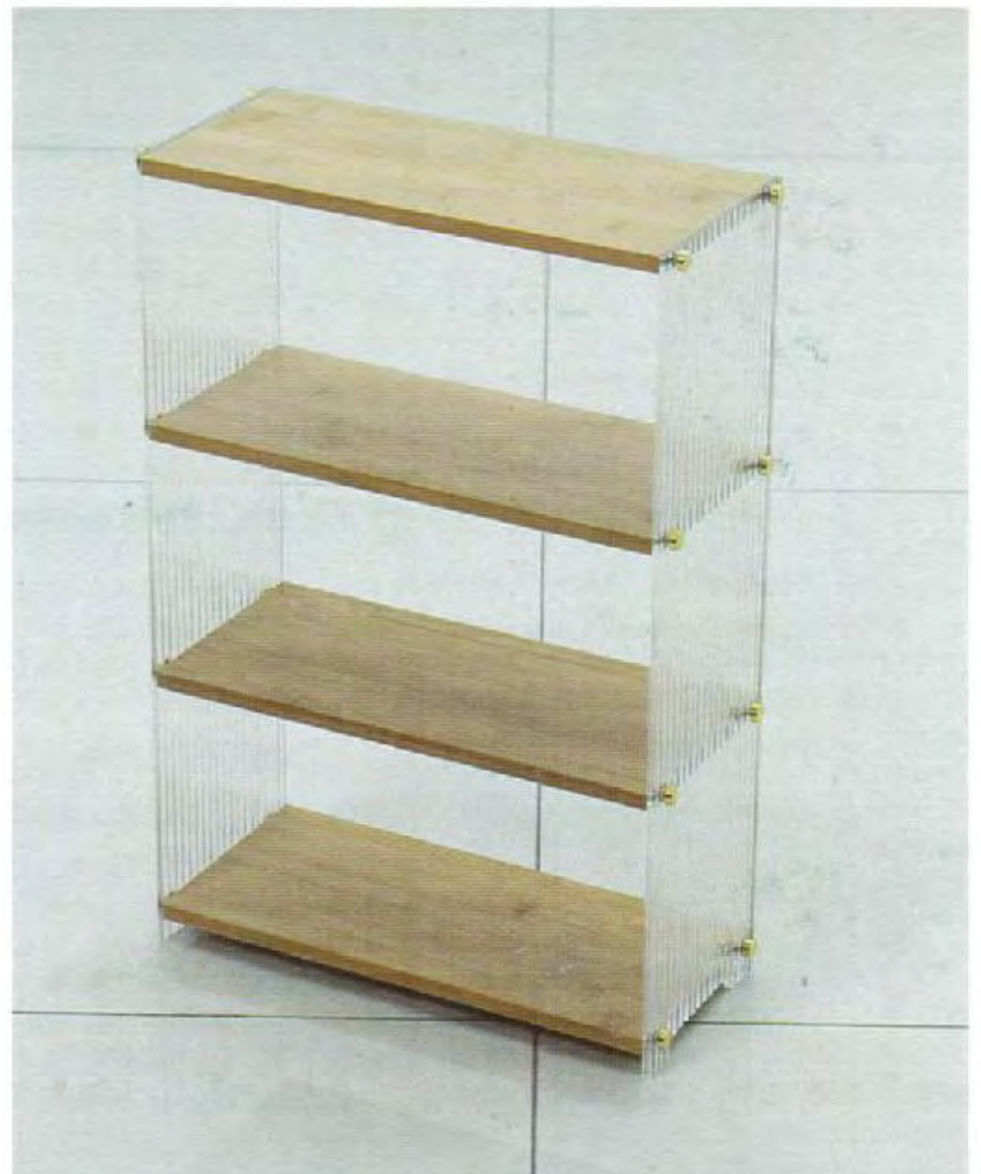
4. Take out the screw cap and screw it in